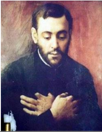
St. Isaac Jogues 1607 – 1646 Feast Day – October 19

“You have heard that it was said, An eye for an eye and a tooth for a tooth. But I say to you, Do not resist one who is evil. But if any one strikes you on the right cheek, turn to him the other also; and if anyone would sue you and take your coat, let him have your cloak as well; and if any one forces you to go one mile, go with him two miles.” (Matthew 5:38-41)